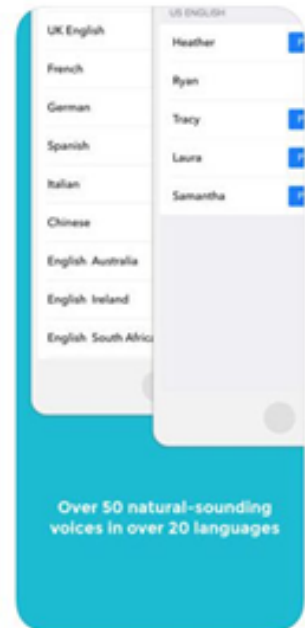
Over 50 natural-sounding voices in over 20 languages